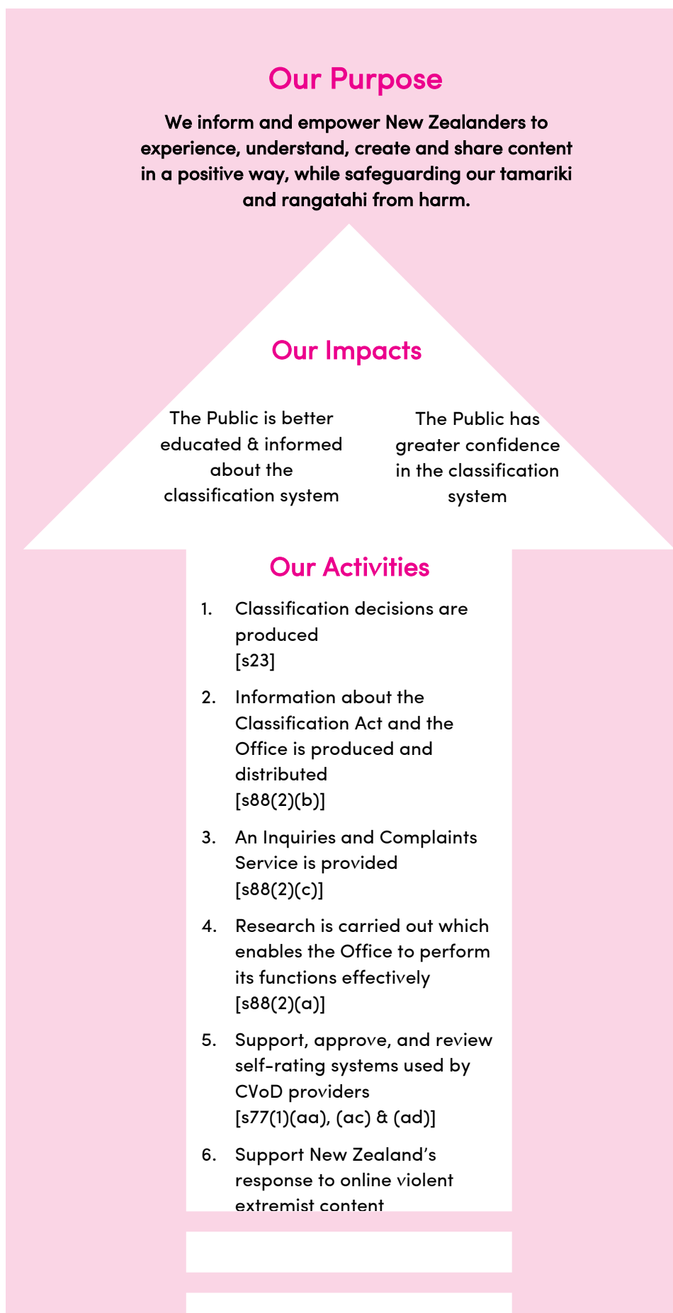
Figure 1: Outcome Structure